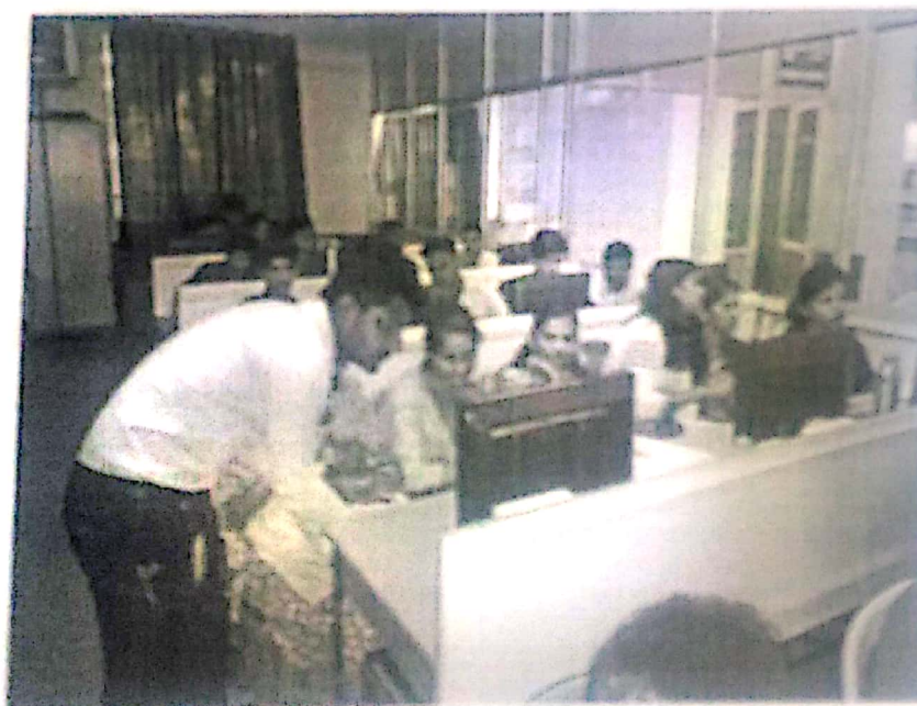
Expert guiding students during practical session