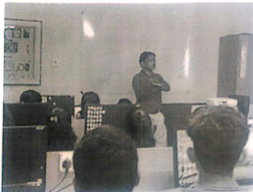
Expert delivering session

Office: At & Po Ambay (Devrukh) Tal. Sangmeshwar Dist. Ratnagiri, Pin - 415804 (Maharashtra) ☎ (02354) 269403/269401 • Email info@rmtce.ac.in • Website www.rmtce.ac.in • DTE Code: 3202